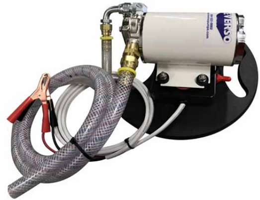
12V or 24V DC System