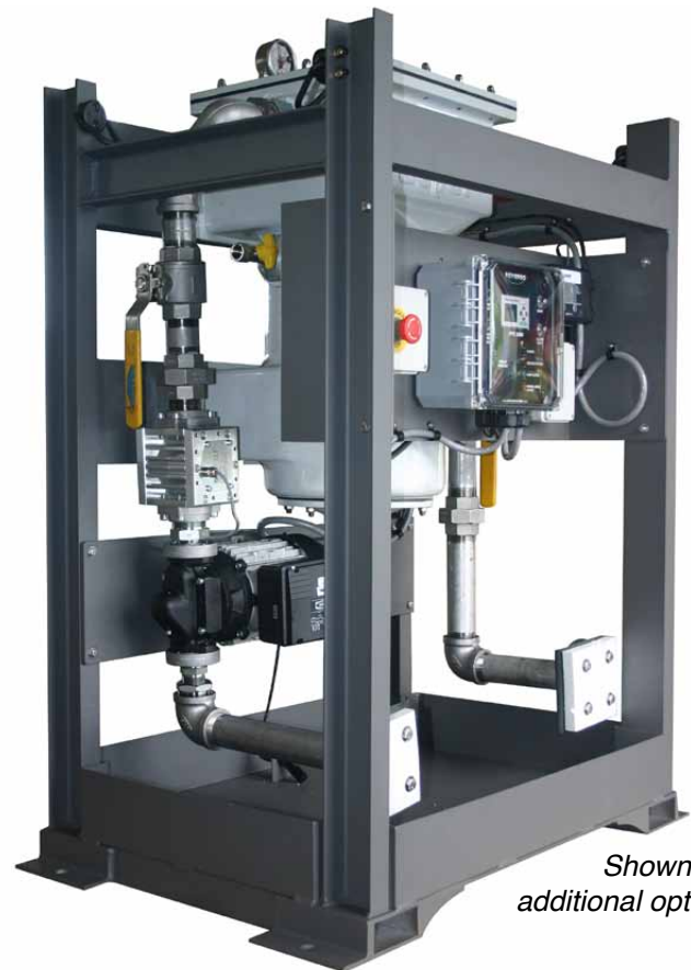
Shown with additional options.