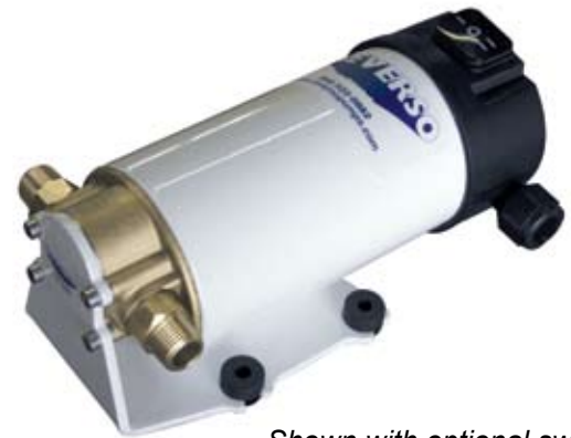
Shown with optional switch