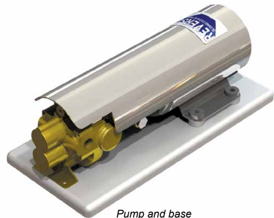
Pump and base