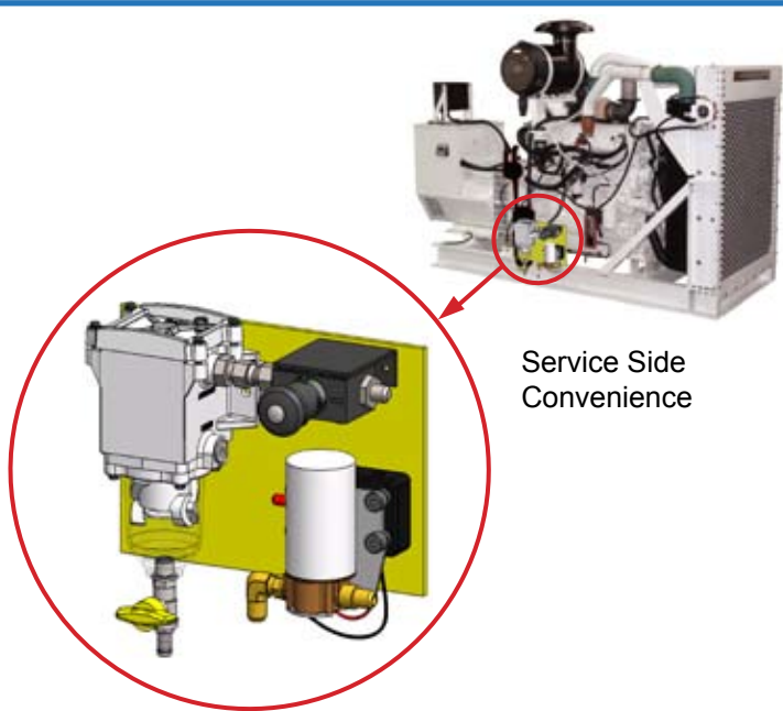
Service Side Convenience