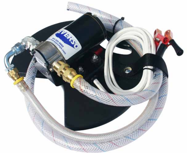
Reversing Switch GP-311BKT