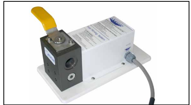
Marine version shown with basic features