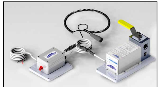
Marine version shown with optional features: Ebox, pendant switch, and fitting kit