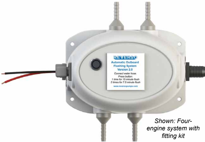
Shown: Four-engine system with fitting kit